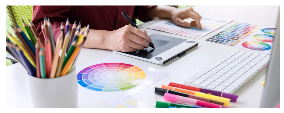
Eye-popping color. Fine detail. A perfect plan for business success.