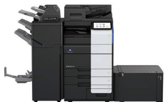
bizhub i-Series 750i