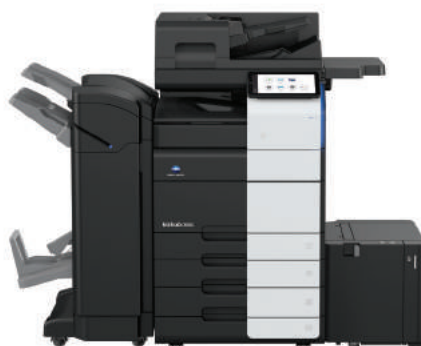
bizhub i-Series C650i