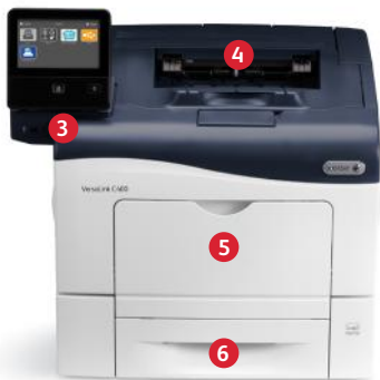
Xerox® VersaLink C400 Color Printer Print.