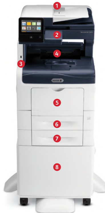
Xerox® VersaLink C405 Color Multifunction Printer Print. Copy. Scan. Fax. Email.